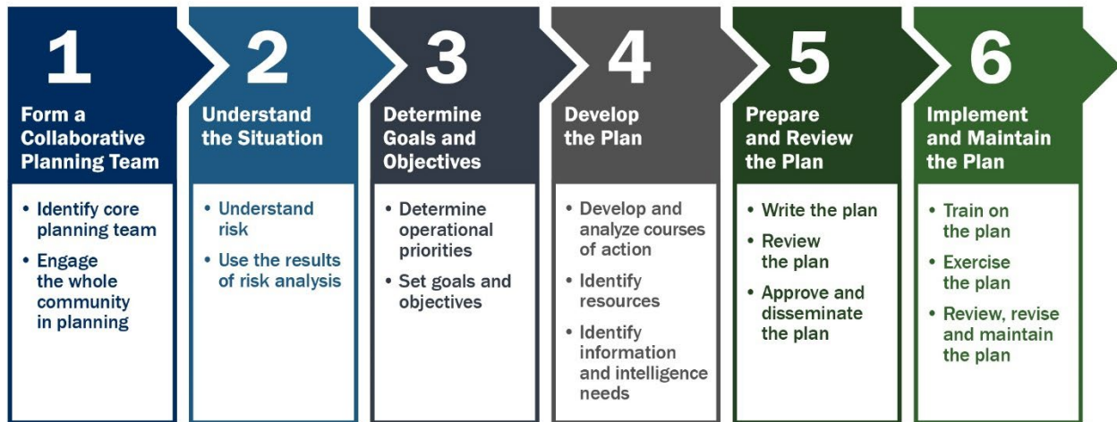
Figure 3. CPG 101 Emergency Operations Six-Step Planning Process

When preparing for cyber incidents, careful planning and collaboration are necessary to ensure a holistic and effective response. Using the six-step planning process detailed in CPG 101: Developing and Maintaining Emergency Operations Plans and shown in Figure 4, the planning team may develop a comprehensive and realistic plan or annex with purposeful involvement from all key stakeholders.