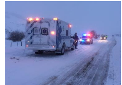
Figure 1: Gunnison Valley Health Paramedics On Scene

Developed as an after-action item following a 2023 CISA Operational Rapid Assistance Package (ORAP) assessment, Gunnison Valley Health's project aims to address regional connectivity gaps that affect Emergency Medical Services (EMS) response, medical direction, and quality of patient care. Due to the topography of Gunnison County in western Colorado, the jurisdiction's EMS response area has multiple radio and cellular service dead zones in which there is neither 800 megahertz nor cellular connectivity. Cell service is essential for clinically necessary data transmissions and phone use is the preferred private consultation method between paramedics and physicians. Cellular broadband is vital for the use of a mobile smartphone application, which allows for instant activation of trauma, stroke, heart attack, sepsis, and mass casualty incident alerts. These alerts allow for simultaneous notification of designated response teams, including surgical teams and air medical transportation activation.