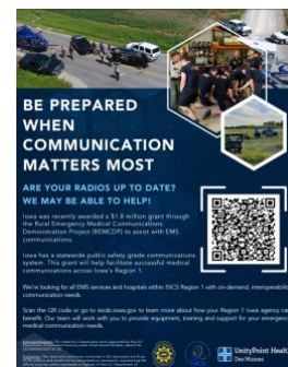
Figure 2: Iowa DPS Flyer

Iowa's Department of Public Safety (DPS) aims to continually harden its communication network and maintain uninterrupted interoperability in rural emergency medical communications. Iowa is the nation's 12 th most rural state, with 36% of its 3.2 million residents living in rural communities. Following a 2023 CISA ORAP assessment, Iowa identified variable current radio usage protocol applications, inconsistent Iowa Statewide Interoperable Communications System (ISICS) radio platform adoption, a lack of department-level standard operating procedures (SOPs), end-user reliance on both dispatch to ensure interoperability and cellular telephone networks for critical communications, and an outdated statewide EMS communications plan were gaps in emergency medical communications infrastructure.